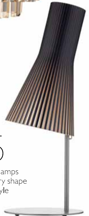
Table lamps in every shape and style