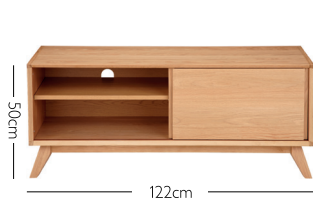
Entertainment unit H50 W122 D40cm 862 32601 £299