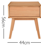
Lamp table H56 W44 D44cm 862 22601 £149