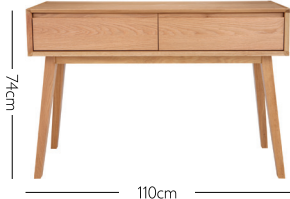
Console table H74 W110 D35cm 862 62601 £299