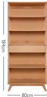
Wide bookcase H184 W80 D40cm 862 72602 £399