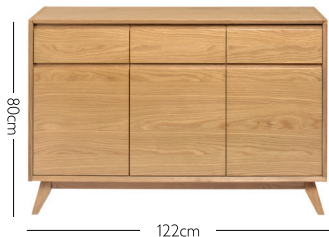
Sideboard H80 W122 D40cm 862 52601 £399