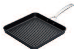
Ribbed Square Grill* long handle