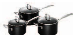
3-piece Saucepan set