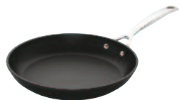
Shallow Frying Pan

Available in a wide choice of shapes and sizes there is a piece to suit every cooking need and occasion.