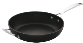
Deep Frying Pan